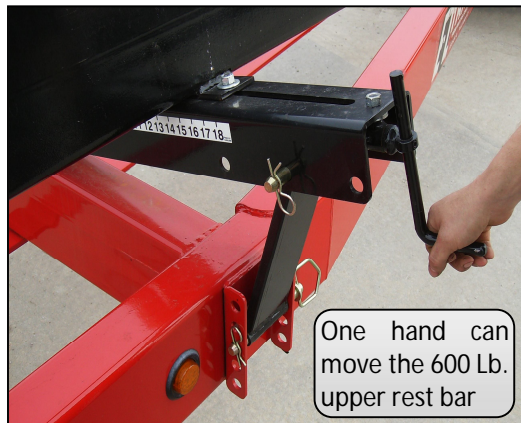
One hand can move the 600 Lb. upper rest bar