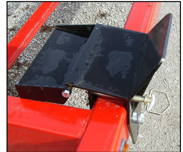
Lower rest: the two-way slider bracket easily accommodates a wide range of header styles without needing special brackets