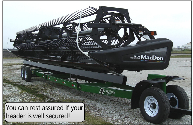
You can rest assured if your header is well secured!