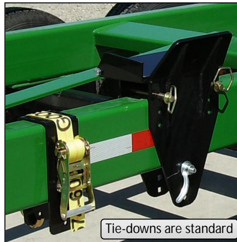
Tie-downs are standard