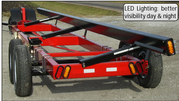
LED Lighting: better visibility day & night

E-Z Trail Header Transports are available in three sizes: 37', 42' & 48'. Color choices are Red or Green .