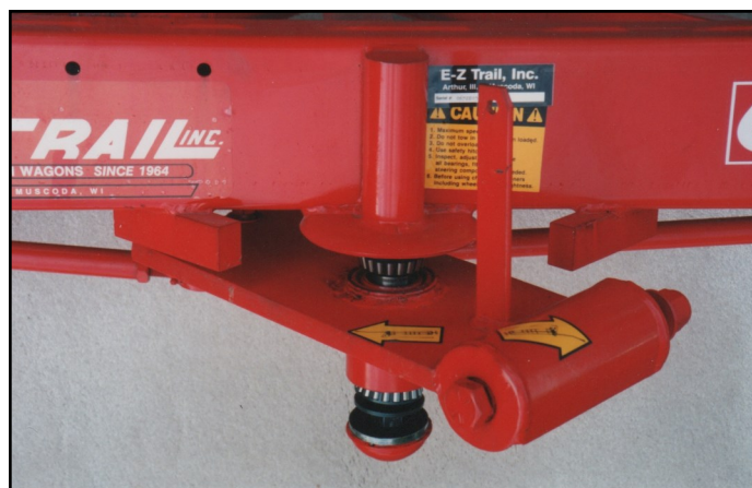
Ruggedly built to withstand the ups & downs of ditches & fields.

"Lifetime" accurate trailing is assured by E-Z Trail's original steering centered around sealed tapered roller bearings, truck type ball joints and dual stops with 100% greater oversteer protection. All steering parts are weather protected for lifetime outdoor use.