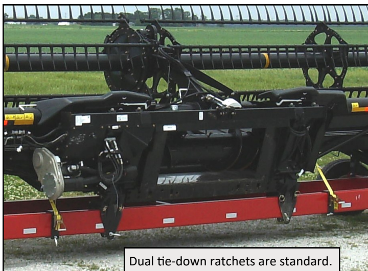
Dual tie-down ratchets are standard.

-- Note: BLACK is now the standard color.