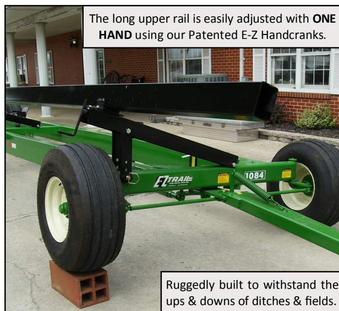
The long upper rail is easily adjusted with ONE HAND using our Patented E-Z Handcranks.

Optional Lighting Kit: a necessity for road use before sunrise and after sunset.