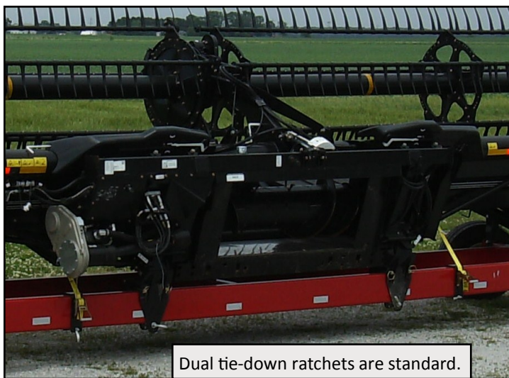
Dual tie-down ratchets are standard.

Lower rest: 2-way slider brackets can be easily adjusted for a wide range of head-er styles without special brackets.