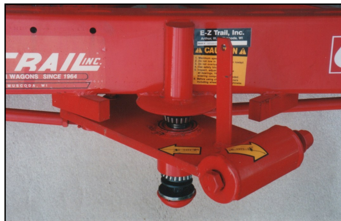
Ruggedly built to withstand the ups & downs of ditches & fields.

"Lifetime" accurate trailing is assured by E-Z Trail's original steering centered around sealed tapered roller bearings, truck type ball joints and dual stops with 100% greater oversteer protection. All steering parts are weather protected for lifetime outdoor use.