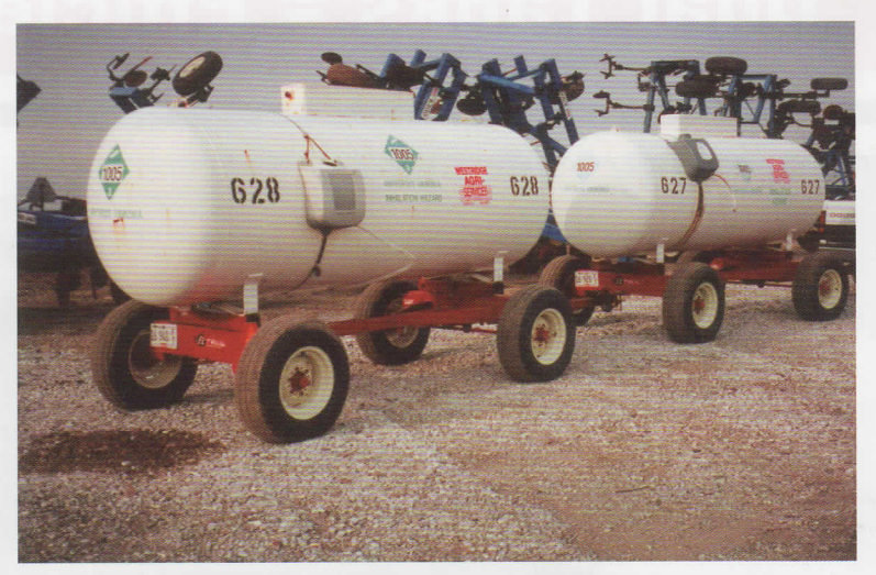
Model 860 has 16,000# capacity and 60" wheel tread which is ideal for side dressing 30" rows.